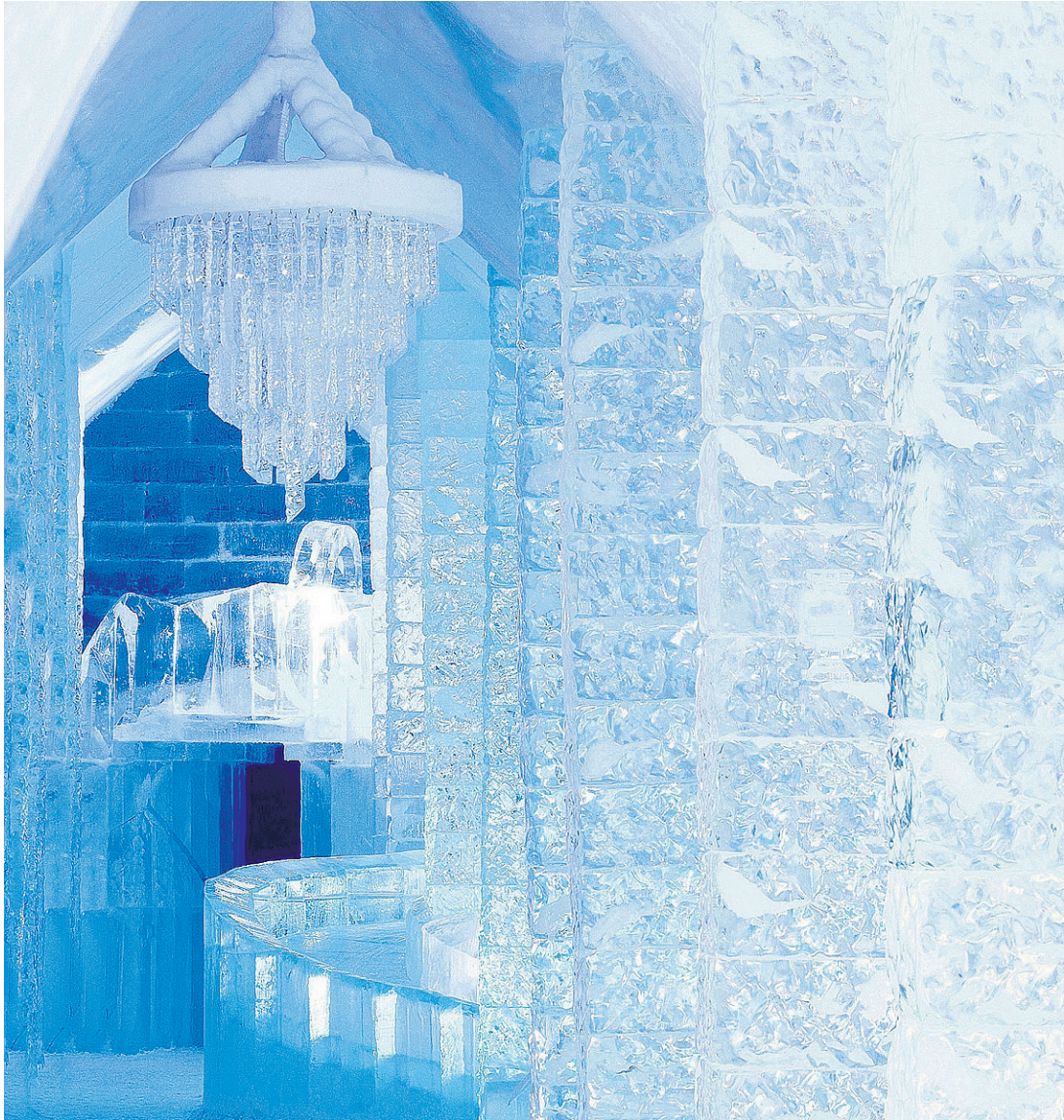
HÔTEL DE GLACE The lobby at the Hôtel de glace near Quebec City offers a warm welcome, even though the temper- ature is about -3 C. The hotel, with 44 guest rooms, includes thermal sleeping bags and four hot tubs.

ROCHELLE LASH SPECIAL TO THE GAZETTE W hen Gilles Vigneault, Que- bec singer and folk hero, wrote “mon pays ... c’est l’hiver,” he wasn’t kidding. It was the revolutionary 1960s, and Vigneault linked Quebecers’ identity, resilience and pride to the rugged, raw climate in which they live. It is a profound image. But win- ter’s bracing air and heavy snow- fall also define our playtime. Festivals, sugaring off, après-ski and outdoor hot tubs—as long as there is a fireplace in our future, we are pumped. Did Vigneault mention that the mercury often dips below -30 C? Pas de problème, we say. The cold- er it gets, the better it is for such thrilling escapades as dogsled- ing and kite-skiing on frozen lakes. Not to mention our glacial gourmandises, such as ice apple cider and maple taffy on snow. Here are some of the most won- drous winter experiences chez nous. Regrets, Montreal, we’re hitting the road. Celebrate: An enduring symbol of Quebec and one of the prov- ince’s most raucous parties, the Carnaval de Québec will shake the capital with a day-and-night extravaganza Jan. 31 to Feb. 16. The festivities will rock our pre- cious, 406-year-old capital from the cobblestone streets of the Old Port to the majestic Plains of Abraham. Don a red tuque and